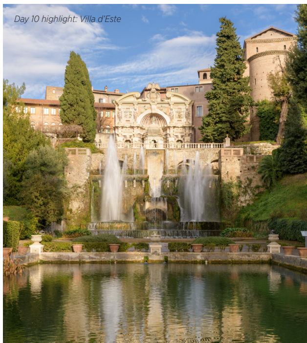
Day 10 highlight: Villa d'Este

Hotel Precise House Mantegna or equivalent