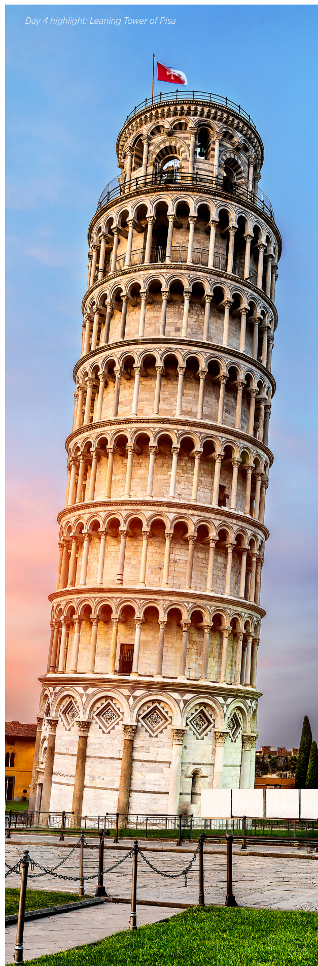
Day 4 highlight: Leaning Tower of Pisa