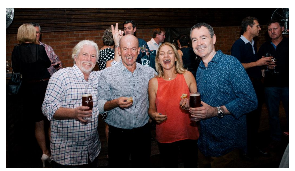
1985 Dentistry Reunion, The Gunshop Café, 2015

All gifts to UQ over $2.00 are tax-deductible.