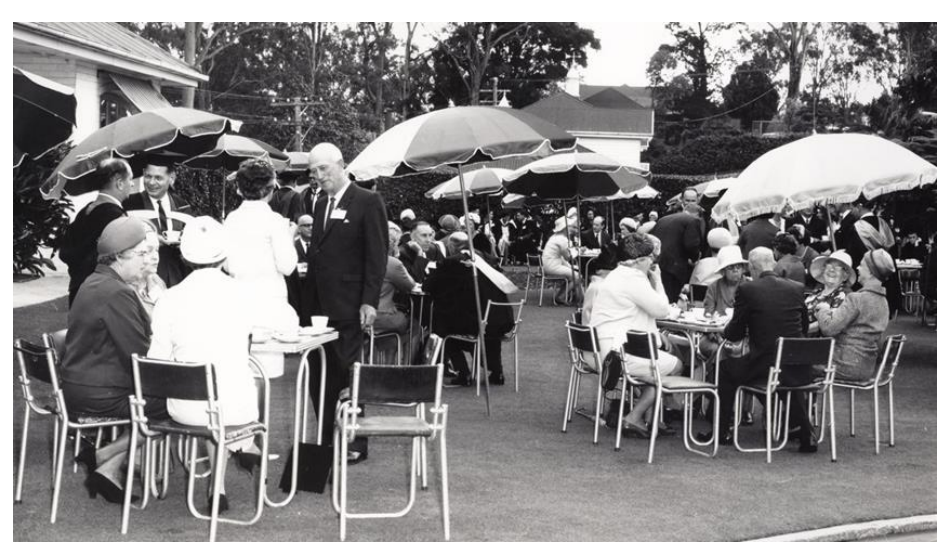
The University of Queensland First Alumni Reunion and Commemoration Garden Party at Queensland House, Rosalie, 19 May 1967

Affinity reunions are gatherings of alumni based on common interests, identities and experiences shared during their time at UQ, such as living at college, playing on a sports team, membership in a special group or club, etc. Unlike class-based reunions, Affinity Reunions can encompass people of all ages, regions, graduating classes and professions and may include individuals from all areas of the broader UQ community including alumni, teachers, staff, students, parents and friends. For further information on Affinity Reunions please contact the Alumni Office on +61 7 3346 3166.