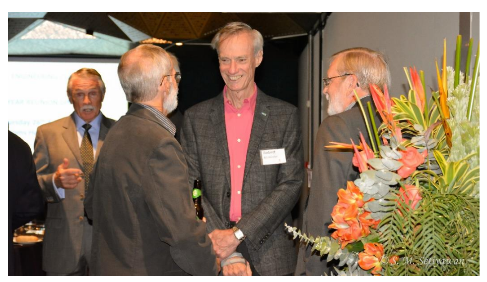
Civil Engineering 50 Year Reunion, Customs House, 2018