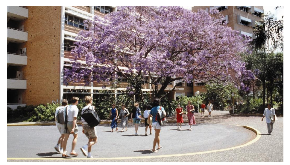
Priestley Building, St Lucia Campus, 1990

The Alumni & Community Relations office can assist at any stage of your planning process!