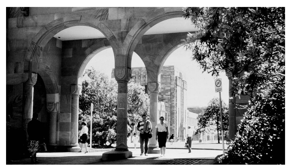
Great Court Cloisters, St Lucia Campus, 15 May 1990

If you need help, call the Alumni & Community Relations office.